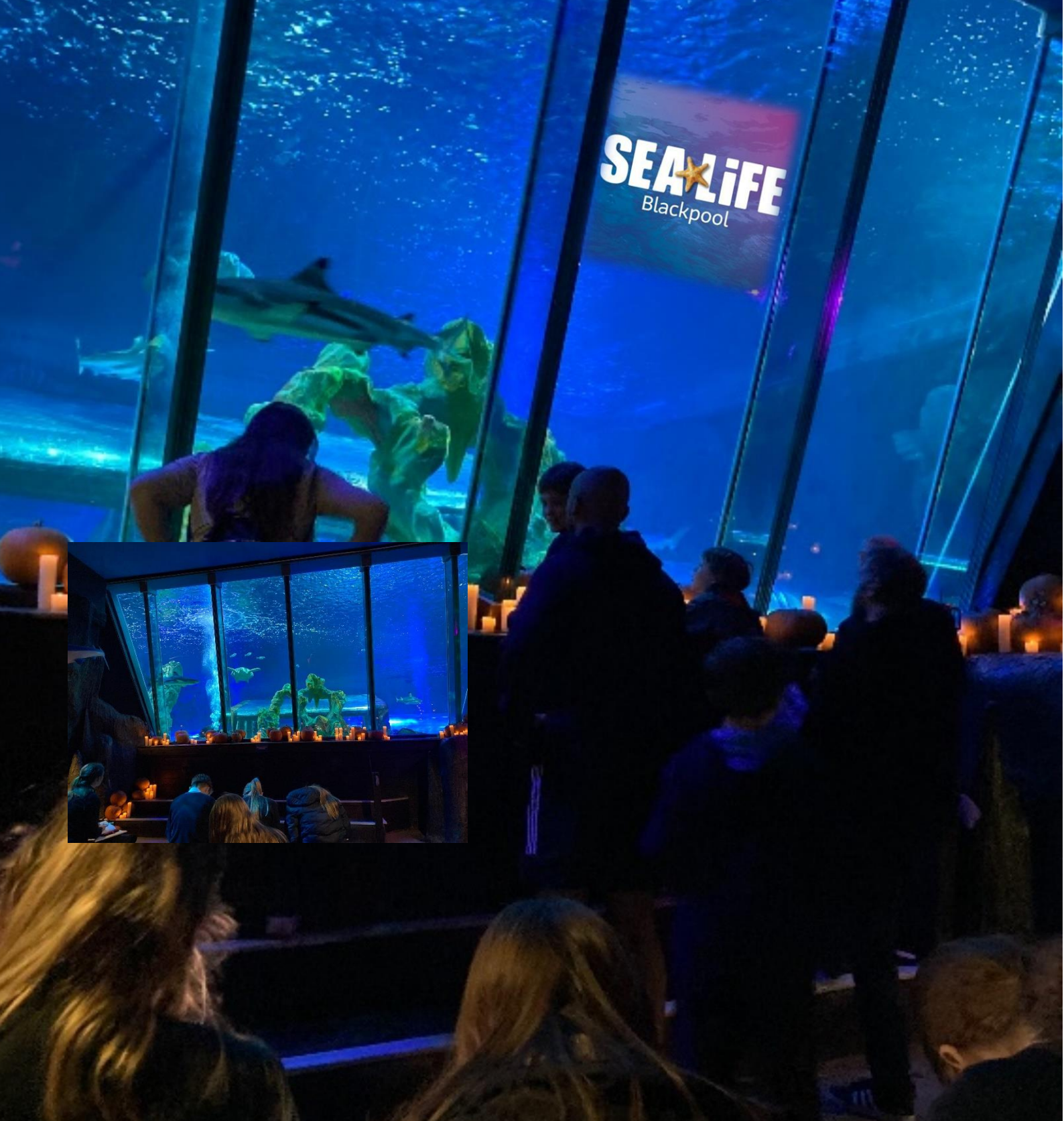
Year 10 GCSE Art pupils had a great day as Blackpool Sealife Centre last month. This is an annual event where the pupils can draw from life ( primary sourced ) which benefits their GCSE project tremendously. Their final pieces which will be in ceramic, and will be featured in a future in a future newsletter. The pupils were a credit to the school as always.